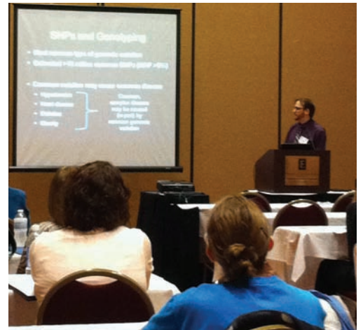
A popular break-out session