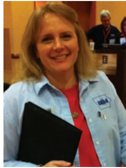
Hmmm. Our NewsScope Editor