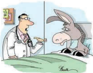
"It's simple. My nurse blindfolds me, I spin around a few times, and then I try to reattach your tail."